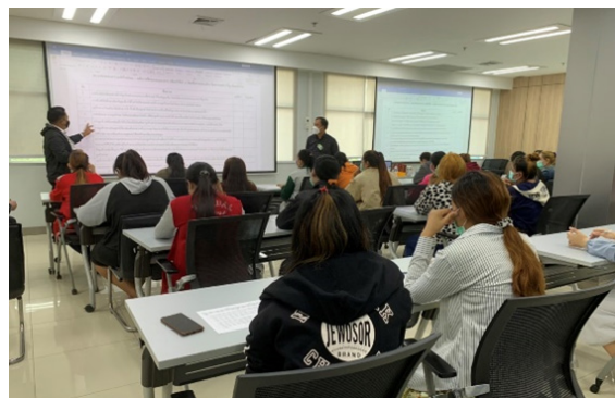
Training sessions by LPN provided to CPF employees