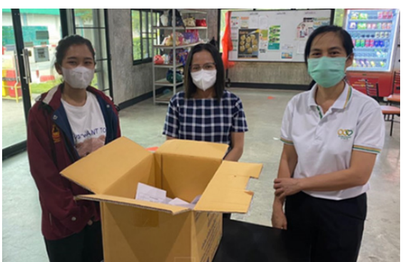
Welfare Committee at Workplace election at a CPF operating facility