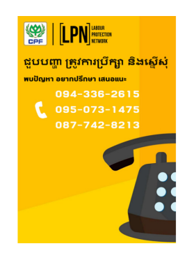
Poster in Cambodian

Posters communicating Labour Voices Hotline by LPN