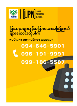
Poster in Burmese