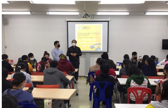
Training sessions by LPN provided to CPF employees

In 2022, over 500 employees (78% migrants) from various operating sites across Thailand attended 14 LPN training sessions. The effectiveness of the training is assessed through tests conducted before and after the training to determine whether the employees developed a better awareness around human and labour rights. The evaluation test comprises 10 true-or-false questions, ranging from free choice to work on overtime hours, grievance channels and cases, to safety and occupational health. The 2022 results show an average score of 71 (out of 100) prior to the training and a score of 91 after the training.