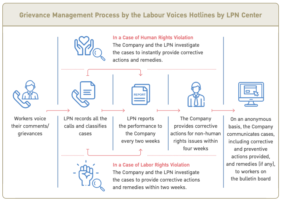
Grievance Management Process by the "Labour Voices Hotline by LPN"

Cases of complaints or whistleblowing made through the "Labour Voices Hotline by LPN" are handled and managed as follows: