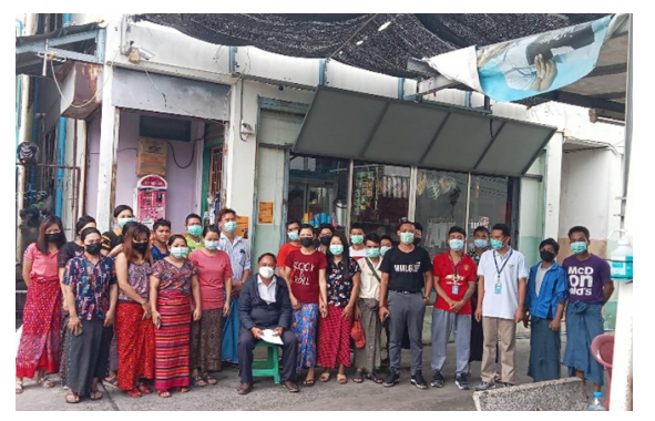
Focus group session in form of dorm visits and meet-and-greets