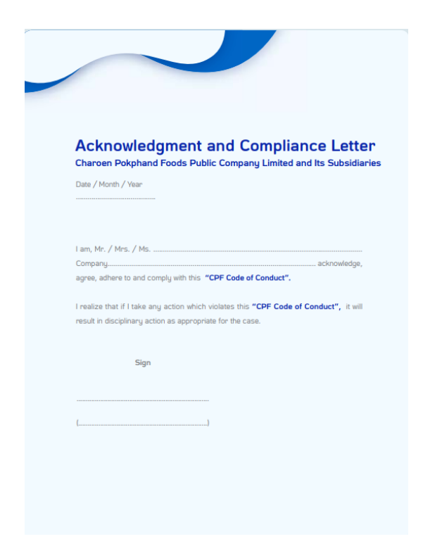
Letter of Acknowledgement and Compliance with CPF Code of Conduct