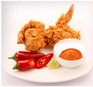
Hot n Smokey

The restaurant's journey in India began in 2012 with its first outlet in Bangalore and today it is present in more than 320 locations across Bangalore, Hyderabad, Chennai. Five Star Chicken manages end-to-end system of the supply chain right from the farm and processing units to distribution in outlets resulting in high quality and affordable food – making Five Star a true “Farm-To-Fork” QSR Chain. All of the products are 100% Antibiotics Free as the flow of food – right from hatching of eggs.