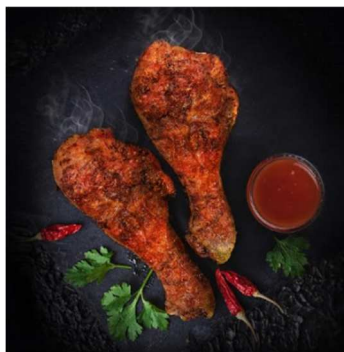
Southern Spice Chicken

The restaurant's journey in India began in 2012 with its first outlet in Bangalore and today it is present in more than 320 locations across Bangalore, Hyderabad, Chennai. Five Star Chicken manages end-to-end system of the supply chain right from the farm and processing units to distribution in outlets resulting in high quality and affordable food – making Five Star a true “Farm-To-Fork” QSR Chain. All of the products are 100% Antibiotics Free as the flow of food – right from hatching of eggs.