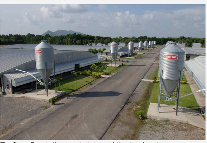
The Green Farm in Kanchanaburi shows visitors how it works

Charoen Pokphand Foods Plc. (CPF) is moving to make its hog farms into green farms.