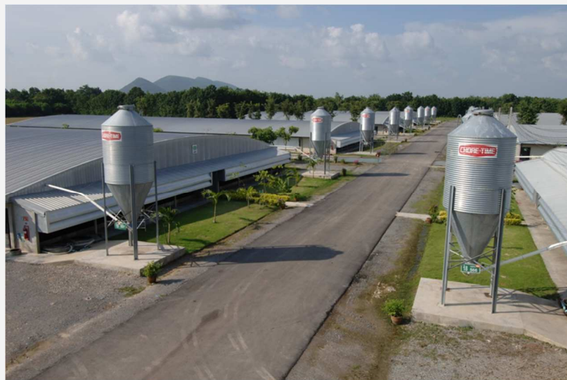
The Green Farm in Kanchanaburi shows visitors how it works

Charoen Pokphand Foods Plc. (CPF) is moving to make its hog farms into green farms.